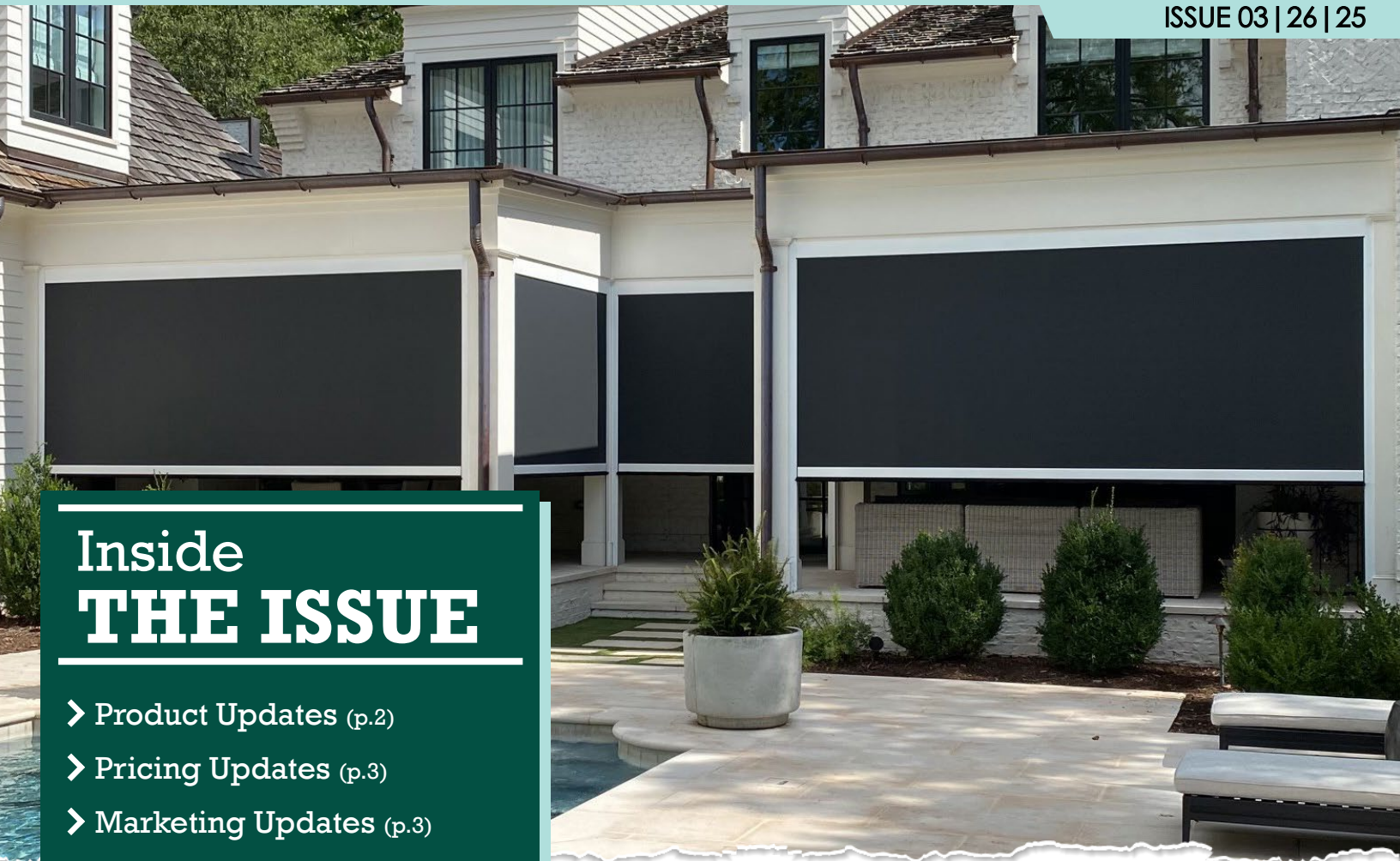
Photo from our September Contest Winner, ECC Coolscreens